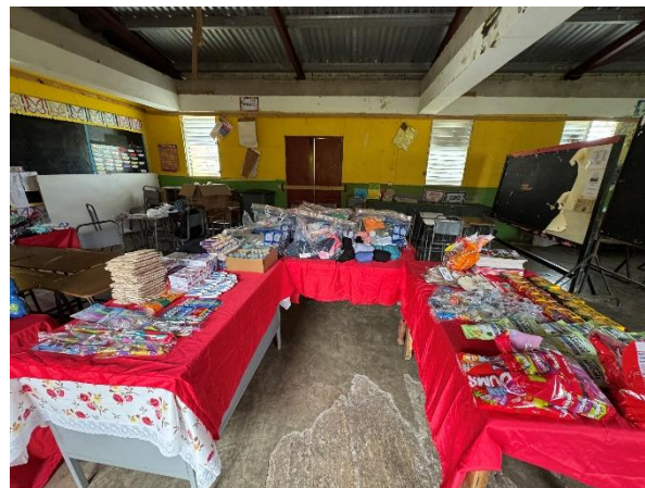
Set-up of toiletries, clothes, medicine and toys for distribution