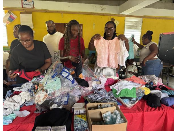
Distribution of clothing to school families