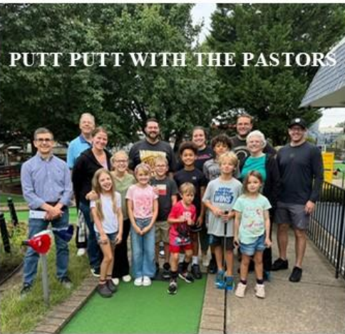
PUTT PUTT WITH THE PASTORS